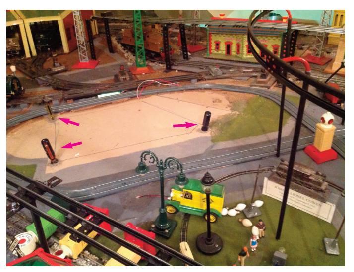
After the great Bessley City Station was moved, the excavation team planned the new access hole. The screw driver handles mark the area where rewiring was required before the large excavation.

The 027 trolley track is supported by 4" crossbars from Texas Lamp Parts. See photograph on next page. Threaded lamp pipe screws into the crossbar. At the bottom the pipe is supported by wood simulated concrete bases which supply some support. The pipes are securely fastened by washers and nuts.