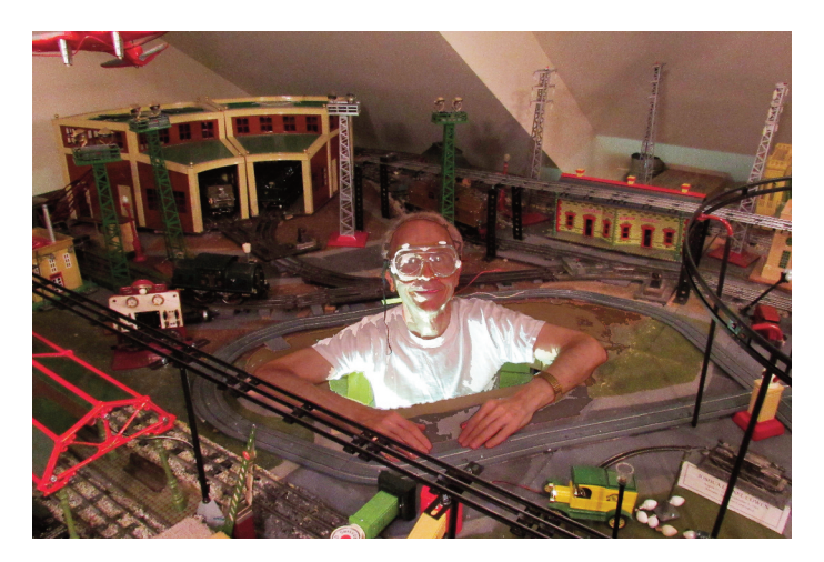
Worn from hours of inspecting very extensive underground wiring, the BRR president emerges back into the world.